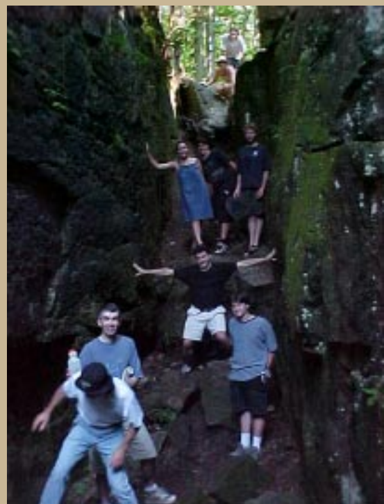
Young Adult Readers Retreat 2001

Silver Springs is very casual. Please travel light and keep baggage to a minimum. □